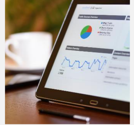
Direct Marketing e.g. Tele-sales, Email, SMS