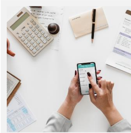
Social Media Platform Engagement