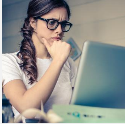
Customer Care and Account Management