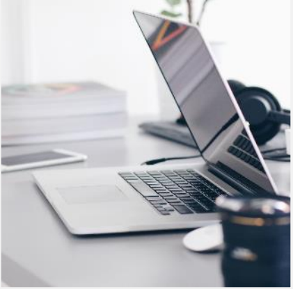
Omnichannel Customer Experience